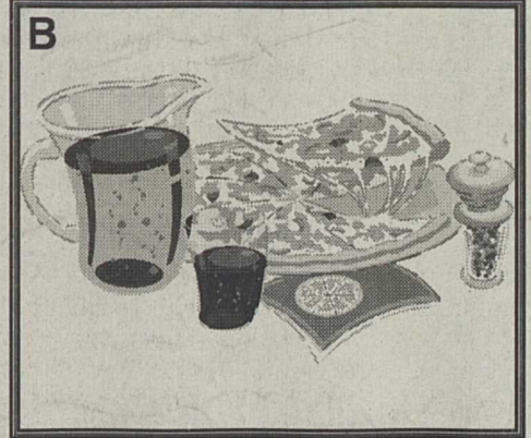
ANSWERS: 1. Soda is a lighter color in the picture 2. Pepperoni is missing from pizza 3. There's no pepperoni in the picture 4. There is no pepperoni in the picture 5. There is no pepperoni in the picture